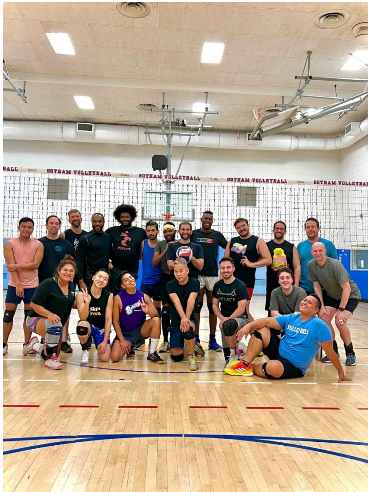
October 2022, Gotham Leadership takes to the court post Fall 2022 tryouts.